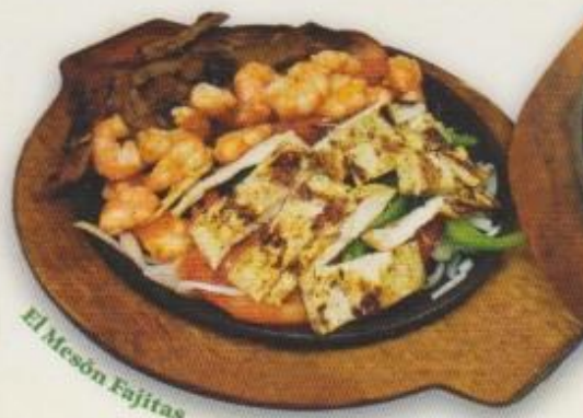
El Mesón Fajitas