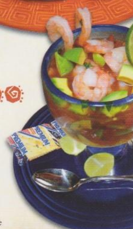
Coctel de Camaron