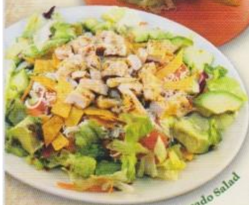
Chicken Avocado Salad