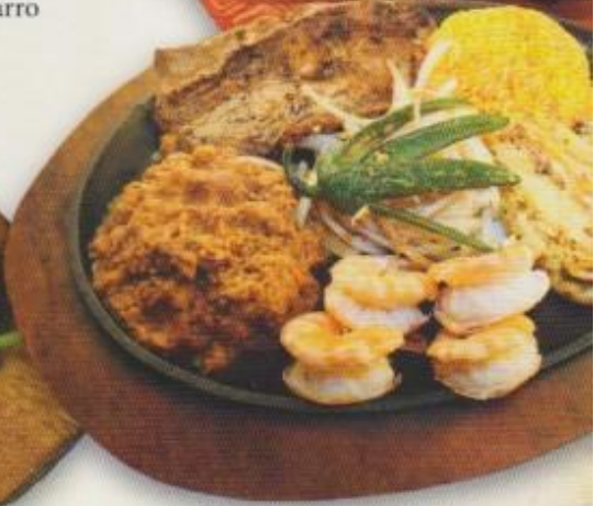
Mar y Tierra Platter