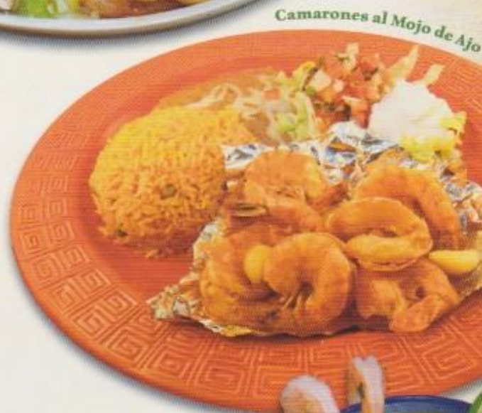
Camarones al Mojo de Ajo