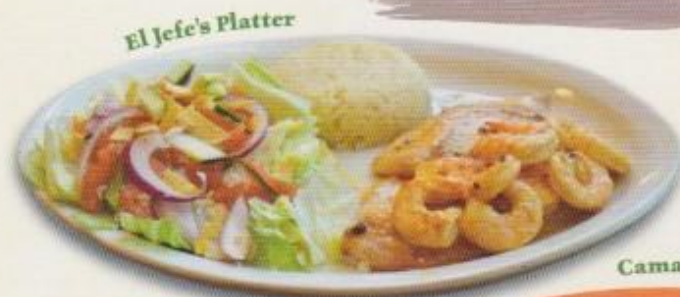
El Jefe's Platter

Tilapia fillet and shrimp served with salad and white rice. $13.99