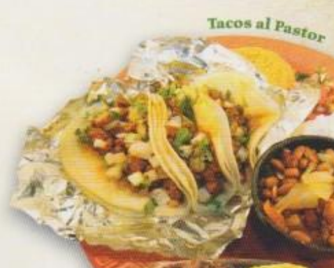
Tacos al Pastor